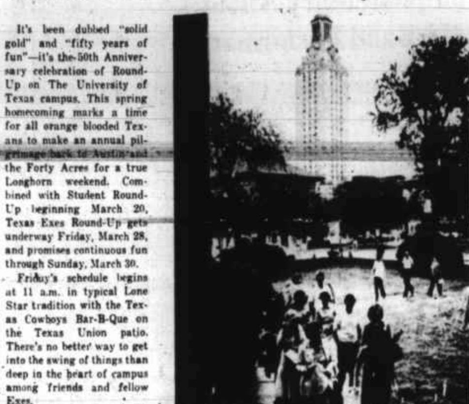
Tour of The University's constantly changing campus.

It's been dubbed "solid gold" and "fifty years of fun"—it's the 50th Anniversary celebration of Round-Up on The University of Texas campus. This spring homecoming marks a time for all orange blooded Texans to make an annual pilgrimage back to Austin and the Forty Acres for a true Longhorn weekend. Combined with Student Round-Up beginning March 20, Texas Exes Round-Up gets underway Friday, March 28, and promises continuous fun through Sunday, March 30.